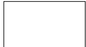
Design your own card back